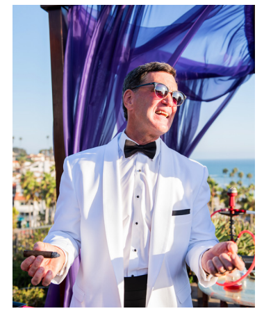
Champagne girls, cigar rollers, props, live bands, photobooths, ice luges, casino games and more!