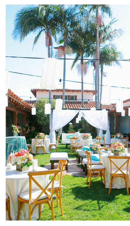
Tip: The Courtyard can be tented to ensure the perfect open-air event experience, rain or shine. Additional fees apply.