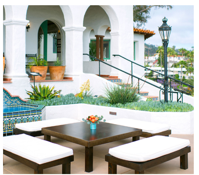
Tip: The property is yours to explore when you rent the full venue. After dinner, take a sunset walk through our gardens and historic home.